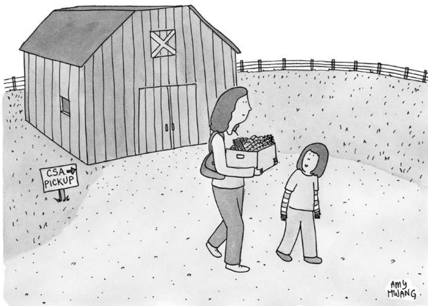
"We should support the local farm as well as the local confectioner."

Following the fall of Communism, in 1989, the new democracies rewrote their laws to put in place rules intended to prevent the recurrence of these kinds of abuses. In subsequent years, the E.U. has promulgated a detailed series of laws designed to protect privacy. According to Mayer-Schönberger, "There